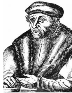
Andreas von Karlstadt