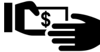
BRIBERY / SIMONY