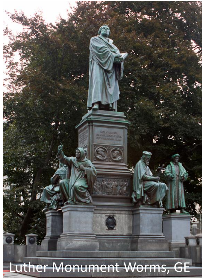
Luther Monument Worms, GE

Preach Scripture: Sermon vs. Mass II Timothy 4:1-2