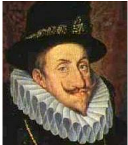
Emperor Ferdinand II 1578 - 1637