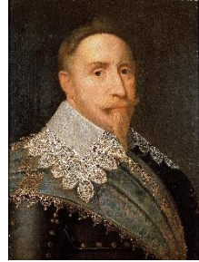
Gustavus Adolphus 1594 - 1632