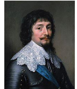
Frederick of Bohemia 1596 - 1632