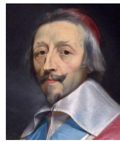
Cardinal Richelieu 1585 - 1642