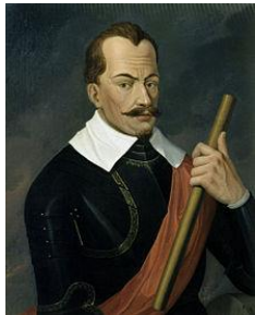
Albrecht von Wallenstein 1583 - 1634