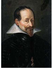
Maximilian of Bavaria 1573 - 1651